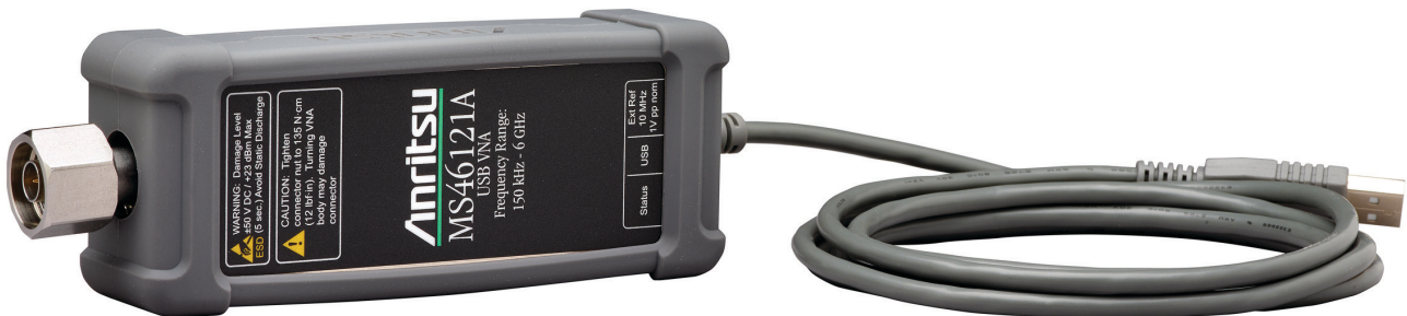
MS46121A ShockLine 1-Port USB VNA