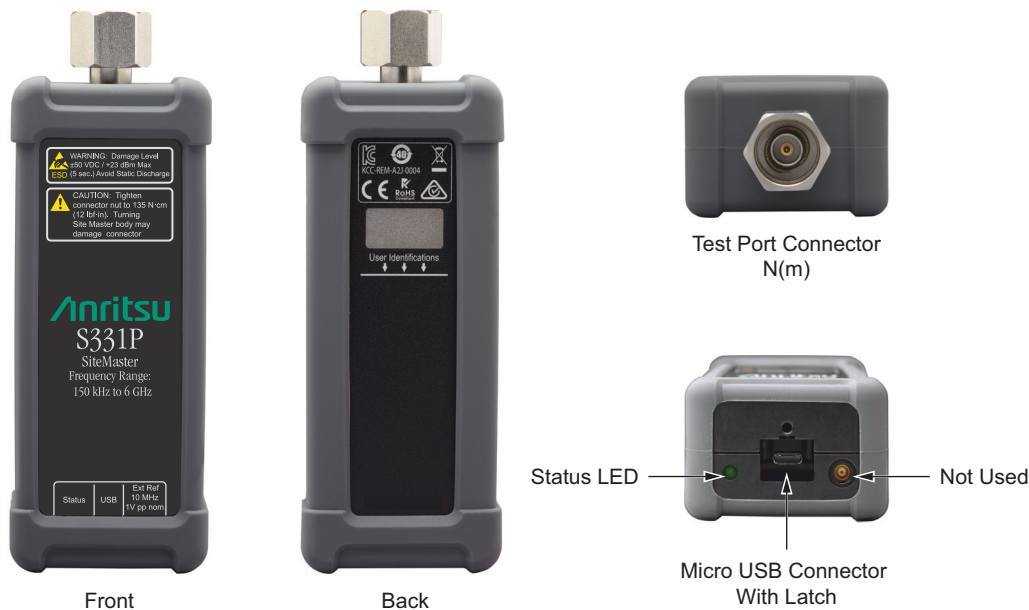
Site Master™ S331P Cable & Antenna Analyzer Featuring USB Connectivity with a Windows PC or Tablet Size: 52 mm x 148 mm x 36 mm (2 in x 5.8 in x 1.4 in), Lightweight: < 0.4 kg (< 0.9 lb)