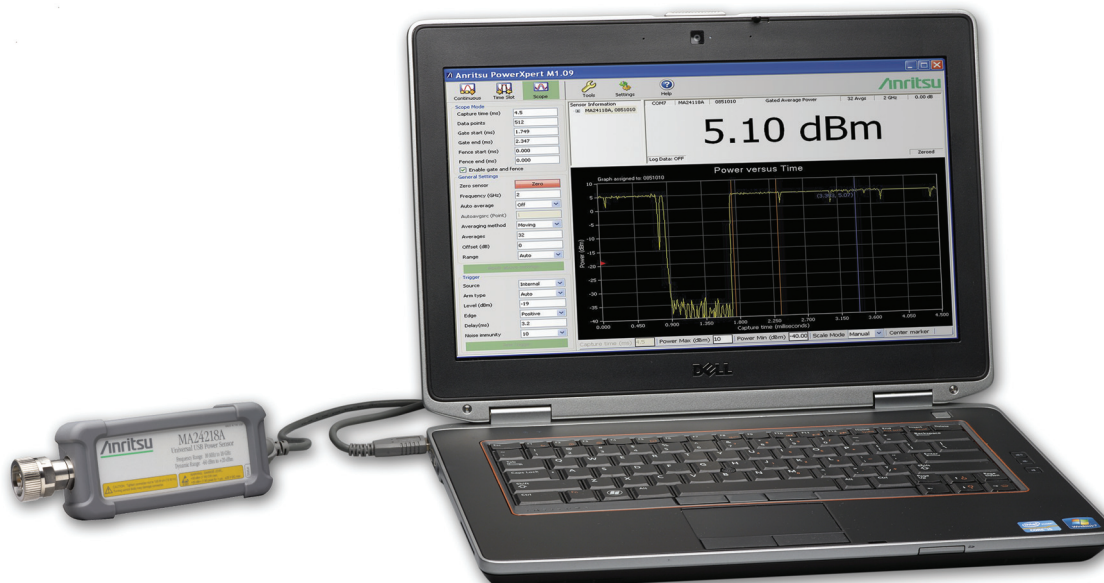
MA24218A Universal USB Power Sensor with PowerXpert™