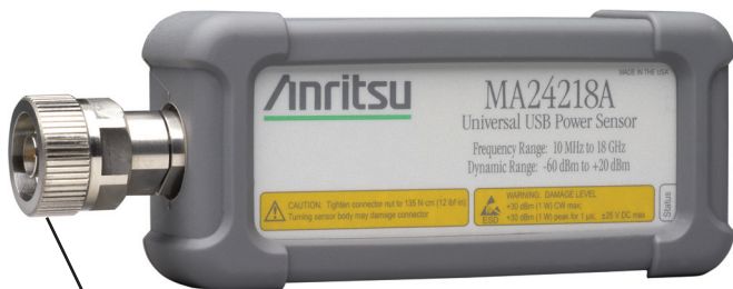
N Type connector designed for use with a torque wrench ensuring repeatable connections